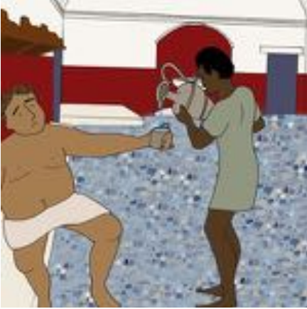
pater est ..... (in via, in apodyterio)