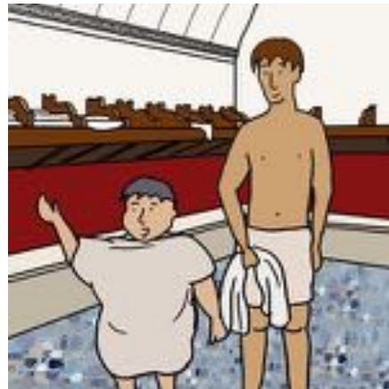
Balbus est ..... (parvus, magnus)