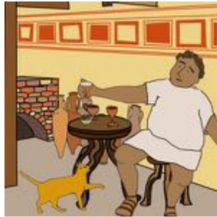
feles est ..... (in taberna, in via)