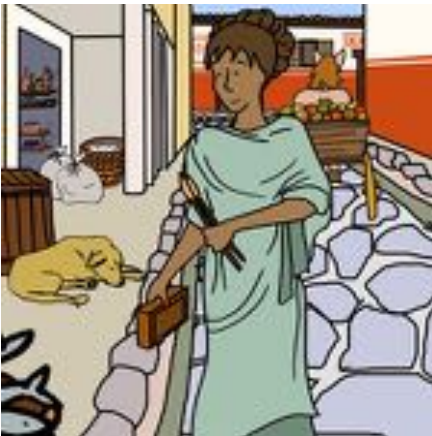
mater est ..... (in villa, in via)