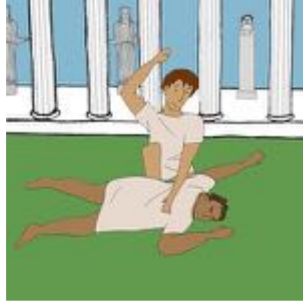
filius est ..... (victor, vetus)